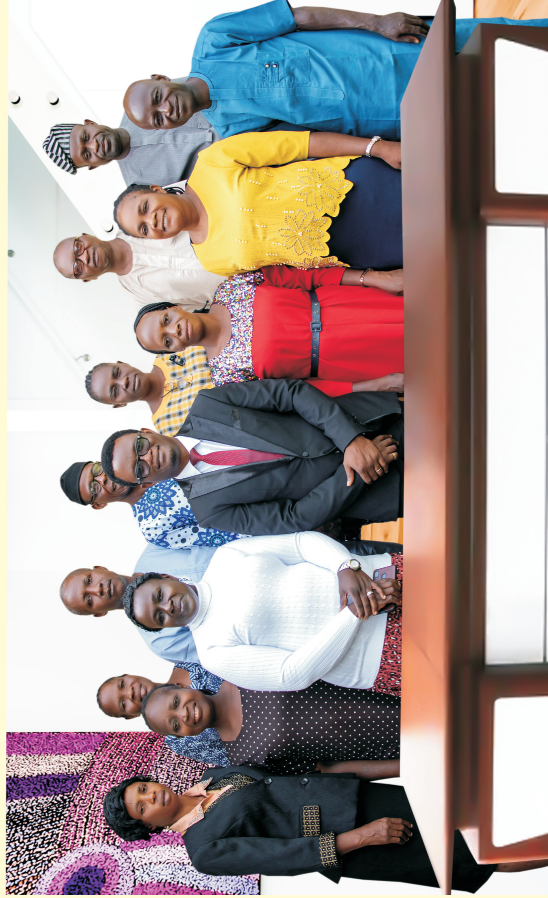
OUTSTATIONS AND SCHOOLS DEPARTMENT STAFF