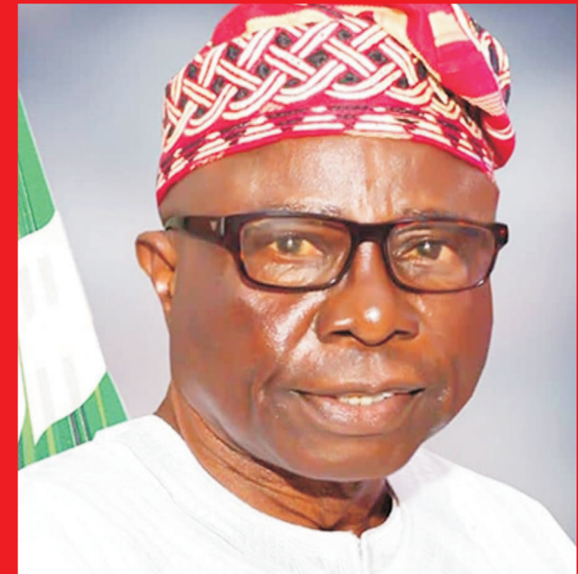
HIS EXCELLENCY OTUNBA BISI EGBEYEMI Deputy Governor