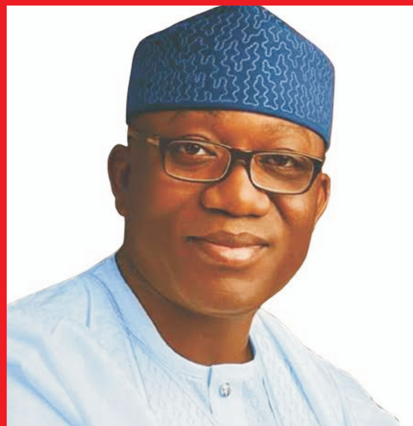
HIS EXCELLENCY DR. JOHN KAYODE FAYEMI CON GOVERNOR