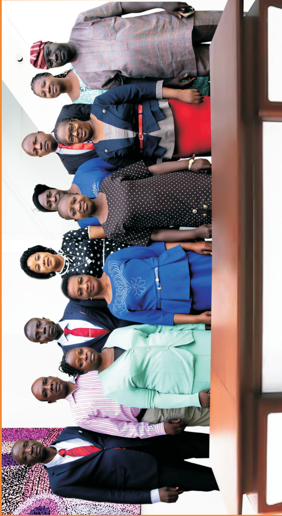
GENERAL HEADQUARTERS AND FIELD ORGANISATION DEPARTMENT STAFF