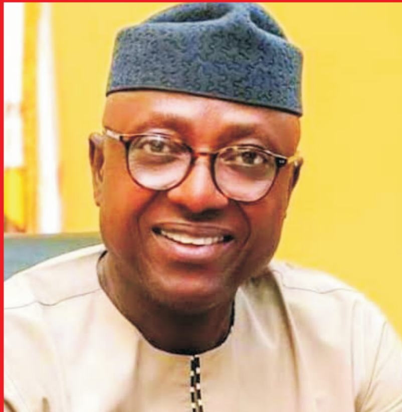
RT. HON. FUNMINIYI AFUYE Speaker, House of Assembly