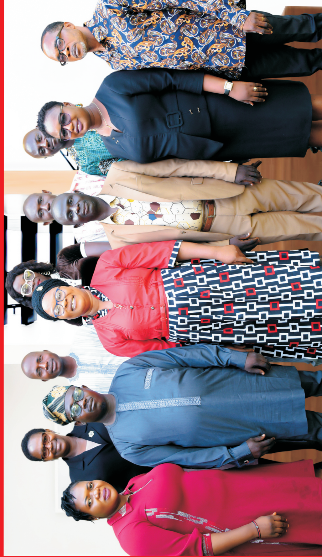
CORPORATION AND GOVERNMENT AGENCIES DEPARTMENT STAFF