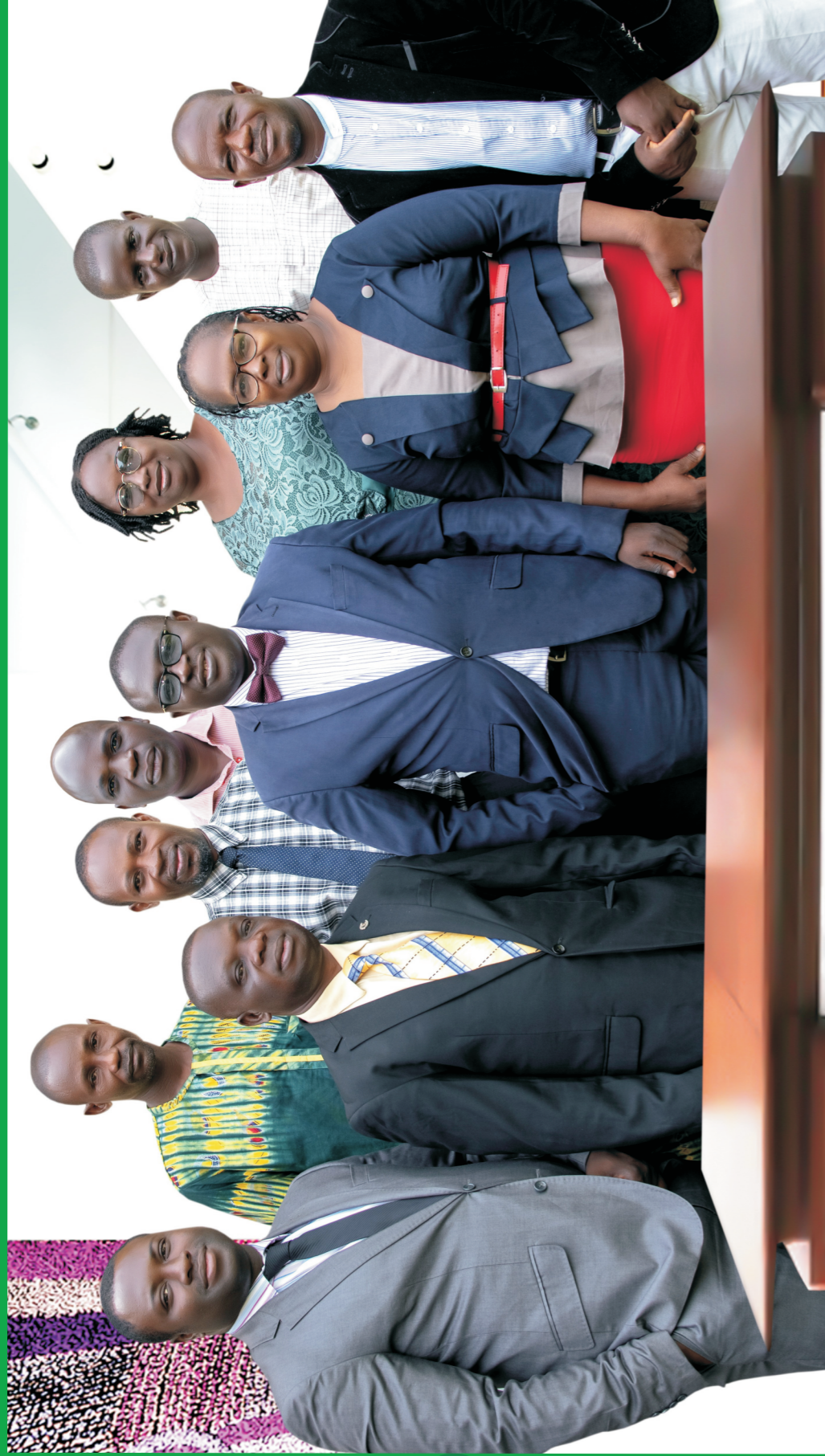
GOVERNMENT ACCOUNT II DEPARTMENT STAFF